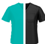
BLACK OR TEAL Physical Therapy