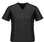
BLACK Respiratory Therapy