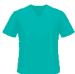
TEAL Patient Transport