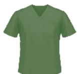
SAGE GREEN Volunteer