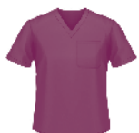
MAROON Environmental Services