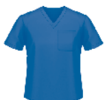
BLUE Registered Nurse